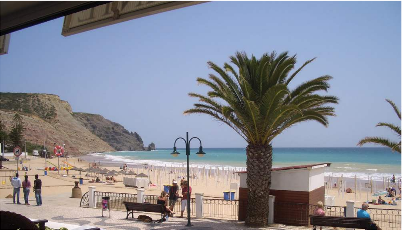
Fig. 2.2 for Question 2