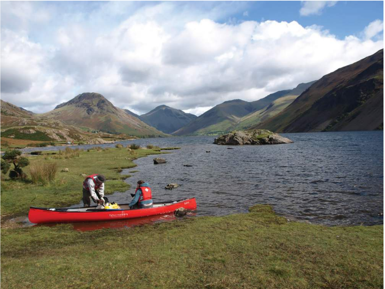
Fig. 6.2 for Question 6